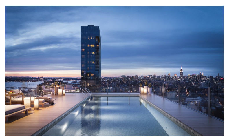
This penthouse with a private pool is asking $42.5 million

$42.5 million penthouse at the Renzo Piano-designed 565 Broome in Soho, is set to hit the market Monday, Mansion Global has learned.