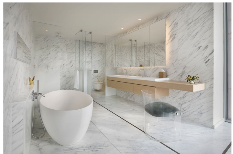
And has four bedrooms, four bathrooms and two powder rooms

https://www.mansionglobal.com/articles/soho-penthouse-designed-by-renzo-piano-headed-to-market-with-42-5-million-price-tag-206718