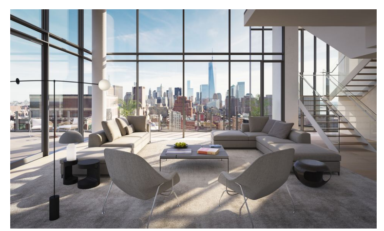
It's at the Renzo Piano-designed 565 Broome in Soho