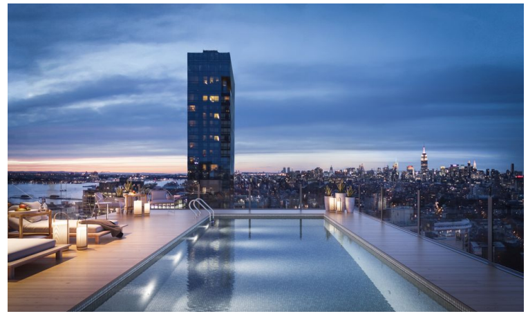
This penthouse with a private pool is asking $42.5 million