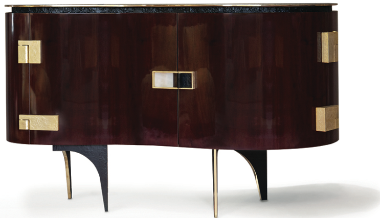
Achille Salvagni sustainable furniture. Courtesy of Achille Salvagni Atelier

The luxury conglomerate Kering has pledged to eliminate the negative effects of its entire production by buying carbon offsets, which help make up for operations that aren't sustainable, including building with concrete and steel. Fortunately, given the disparities and questions about calculating those offsets, more direct alternatives are emerging, such as cross-laminated wood—essentially boards glued together to create panels sturdy enough for high-rise construction—once fire codes adjust to the new technology. “Wood traps carbon as it grows, which is great, and it's a renewable resource,” says Chris McVoy, senior partner with Steven Holl Architects, a New York firm focused on sustainability. Holl often uses geothermal wells to sustainably heat and cool buildings, such as the Reach, the extension of the Kennedy Center in Washington, D.C., completed in 2019.