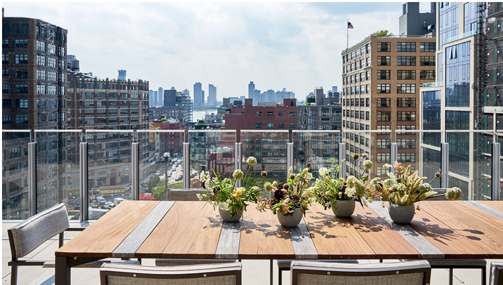
The Broome Street property in New York. Josh McHugh

Sustainability is driving the future of luxury not only in residential and commercial design but also in travel, food production and fashion, as younger consumers reject fuel-gobbling private jets and other high-octane goodies. No one is suggesting the industry is where it needs to be, given the science, but increasingly, consumers who want to make better choices have options: Ships that don't drop anchor to avoid damaging sea beds, off-grid resorts run on solar energy, cities in China that use pneumatic tubes rather than trucks to move waste, and designer fashions made with recycled and renewable materials are becoming more available as luxury consumers seek out and demand these innovations.