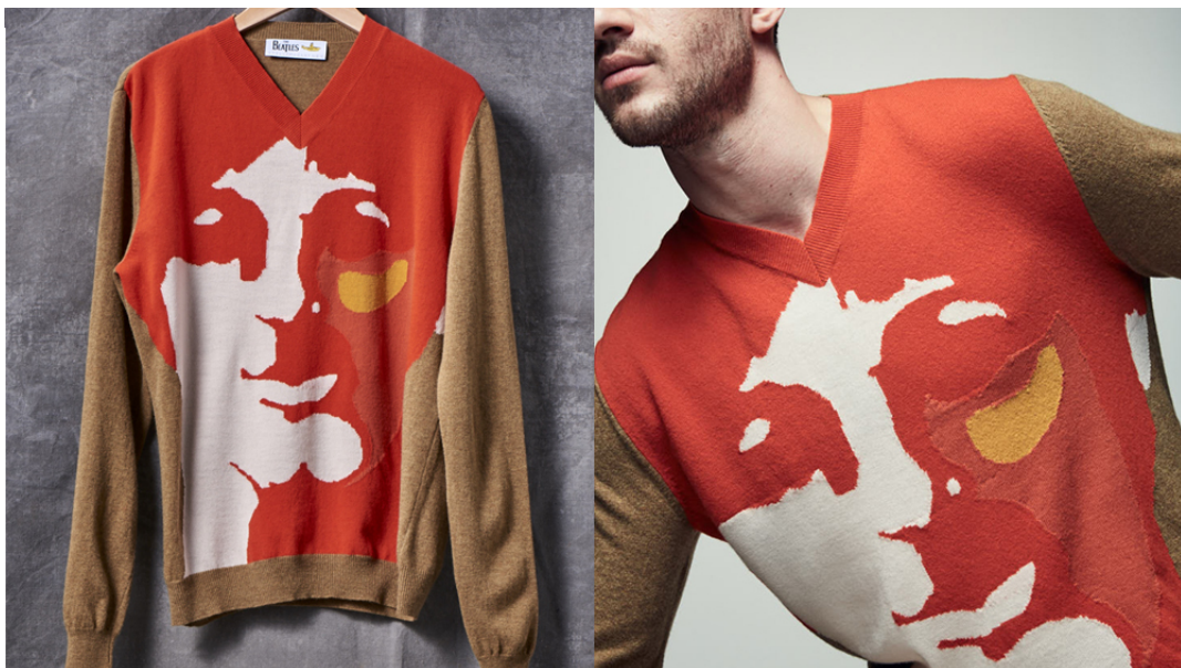
Stella McCartney's All Together Now Sweater.