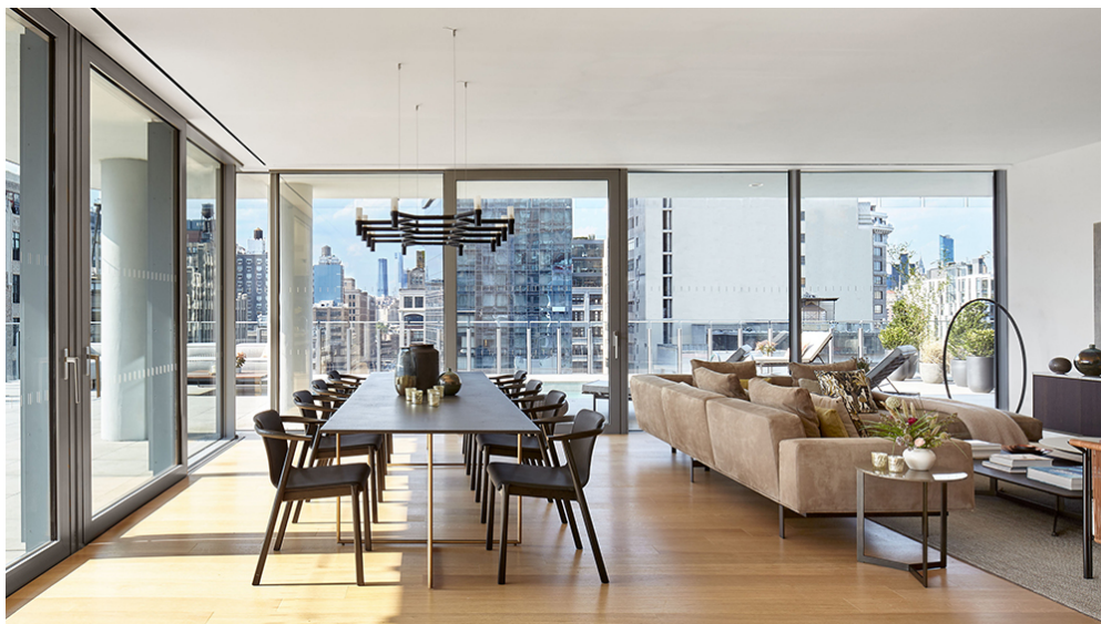
The Broome Street property in New York.