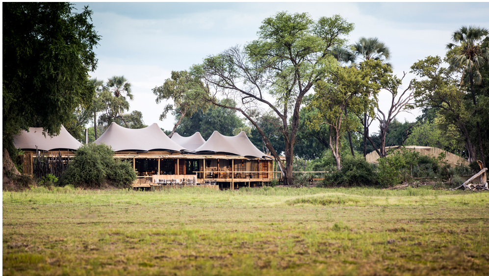
Mombo lodge.