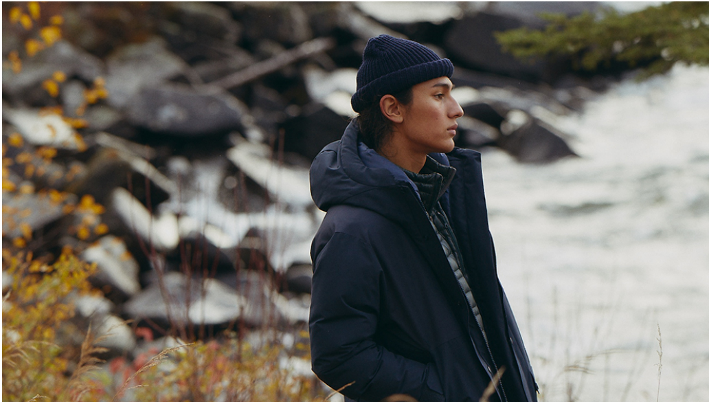
Askov Finlayson parka.