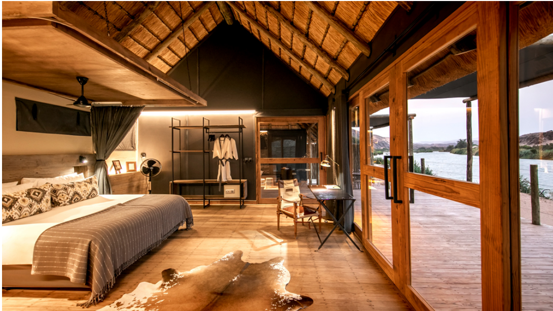
Wilderness Safaris Serra Cafema Camp, Namibi.

Wilderness Safaris stopped using plastic wrap in favor of Buzz Wraps (made of beeswax), offers guests coffee cups made of corn starch, plant sugars and fibers for takeaway, supplies glass water bottles and has created camps that can be built and dismantled with minimal disruption to the environment, leaving the sites able to revert to their natural state within three months.