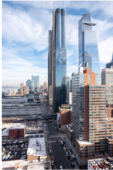
The 15 Hudson Yards condominium, center, also had several sales.

The limestone-clad luxury tower, near 58th Street, was designed by Robert A.M. Stern Architects and developed by Vornado Realty Trust. Since it opened its doors last year, a wide range of deep-pocketed buyers have laid claim to apartments there. In July, the British rocker Sting closed on a triplex for $65.8 million. And earlier this year, the hedge fund manager Kenneth Griffin paid a record $240 million for four unfinished floors.