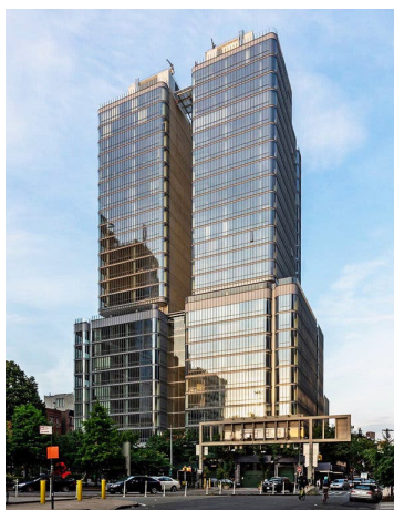
His apartment is one of two penthouses at 565 Broome, which was designed by the Pritzker Prize-winning Italian architect Renzo Piano.