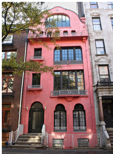
The four-story house at 114 Waverly Place, known as the "pink house," was built in 1826.