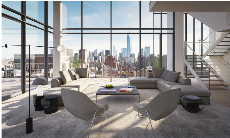
It's at the Renzo Piano-designed 565 Broome in Soho