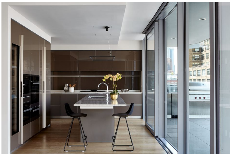
The duplex spans 6,655 square feet