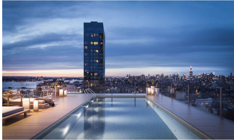
This penthouse with a private pool is asking $42.5 million