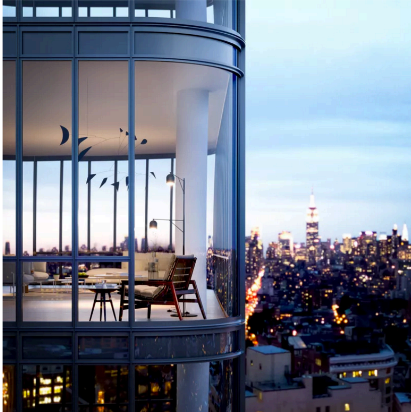
Noë & Associates with The Boundary

BY ZOE ROSENBERG · @ZOE_ROSENBERG · APR 21, 2016, 1:05P